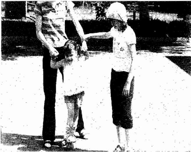
Two older girls teaching the little one to roller blade.